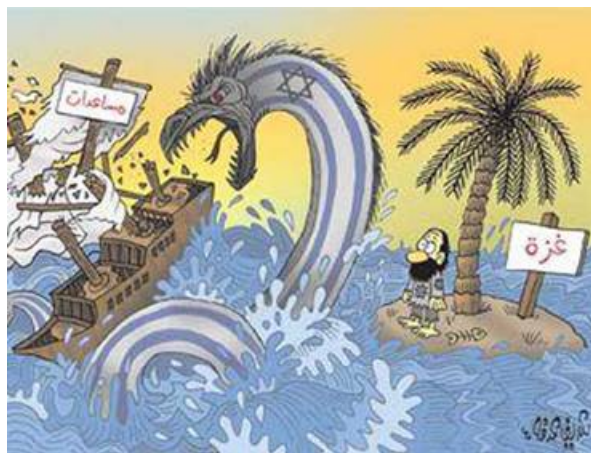
Al-Yaum as-Sabe, June 1, 2010