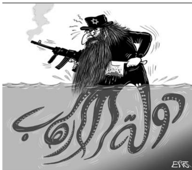
Al-Watan, June 2, 2010

(This stereotypical hook-nosed, black-hatted Jew holds a bloody machete in one hand and an assault rifle in another, while his lower body is composed of tentacles. Cartoonists in Nazi Germany also drew Jews with octopus-like tentacles – and as lice.)