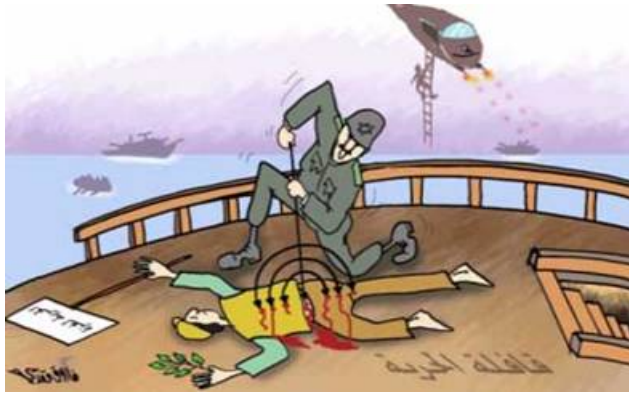
Oman, June 1, 2010