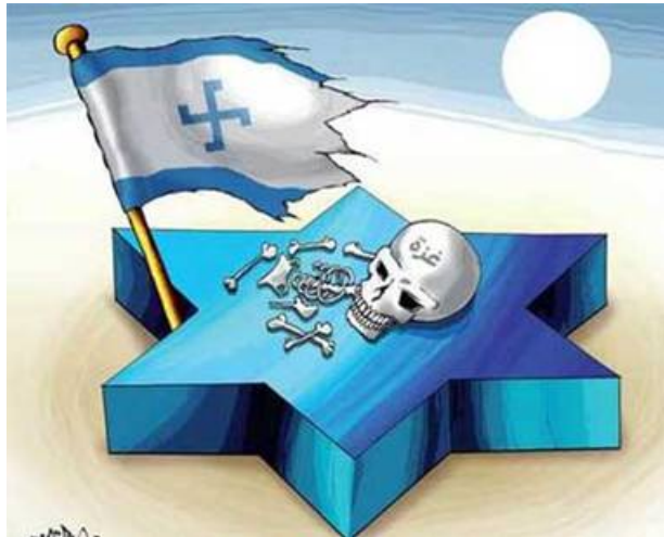
Al-Iqtisadiyya, June 2, 2010

(Reminder: Saudi Arabia, which is one of the world's most oppressive states, is often referred to as "moderate" by the very same New York Times editorial board that berates Israel on an almost daily basis.)