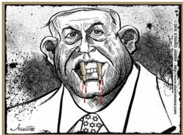
Al-Balad , June 2, 2010