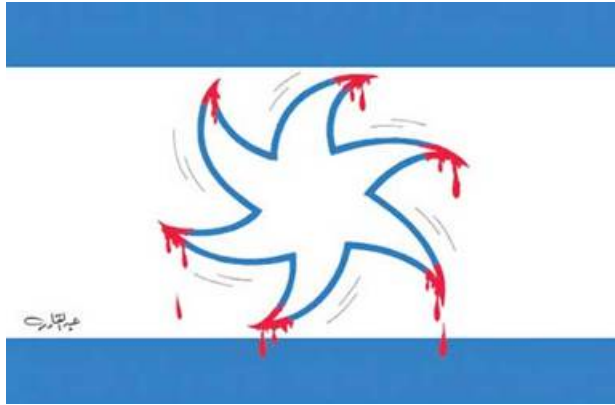
Al-Jarida , June 2, 2010