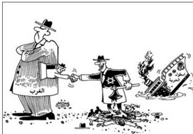
Al-Watan , June 2, 2010

Oman, another “ally” of the United States, has no problem insulting religious Jews and using the Jewish holy symbol, the menorah, to represent a murder weapon.