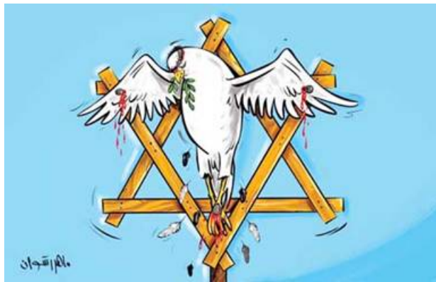
Al-Jarida , June 1, 2010

(Reminder: When Western cartoonists dared to draw Mohammed, over 200 people were killed in riots worldwide. Yet Muslim cartoonists have no trouble defacing the Star of David, and no one complains.)